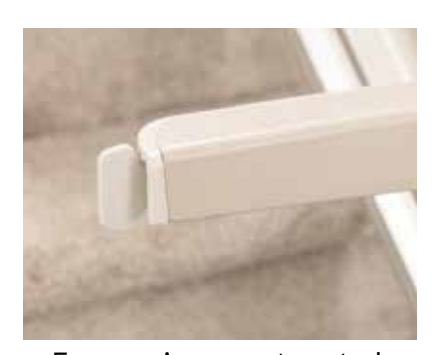
Ergonomic armrest control.