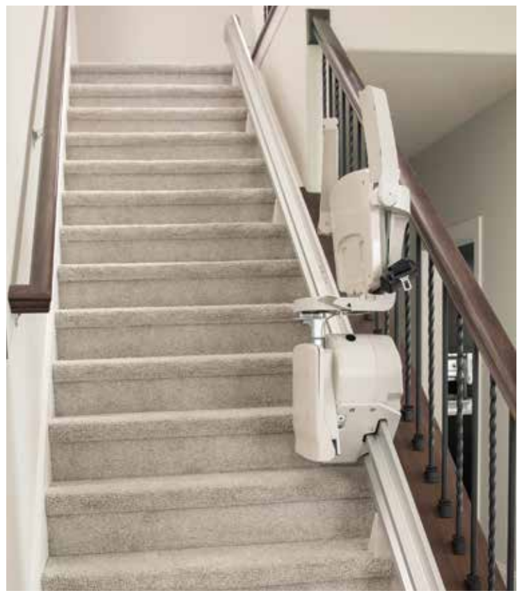
Compact design for open space on stairs.