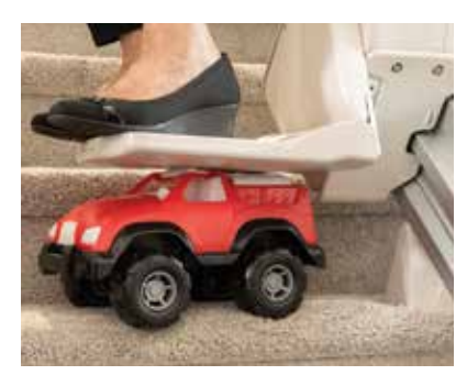
Sensors ensure safety.