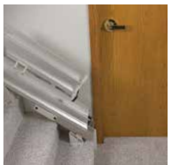
Manual or power folding rail for narrow hallway or when doorway is at the bottom of stairs. Manual operation or push button automatic.