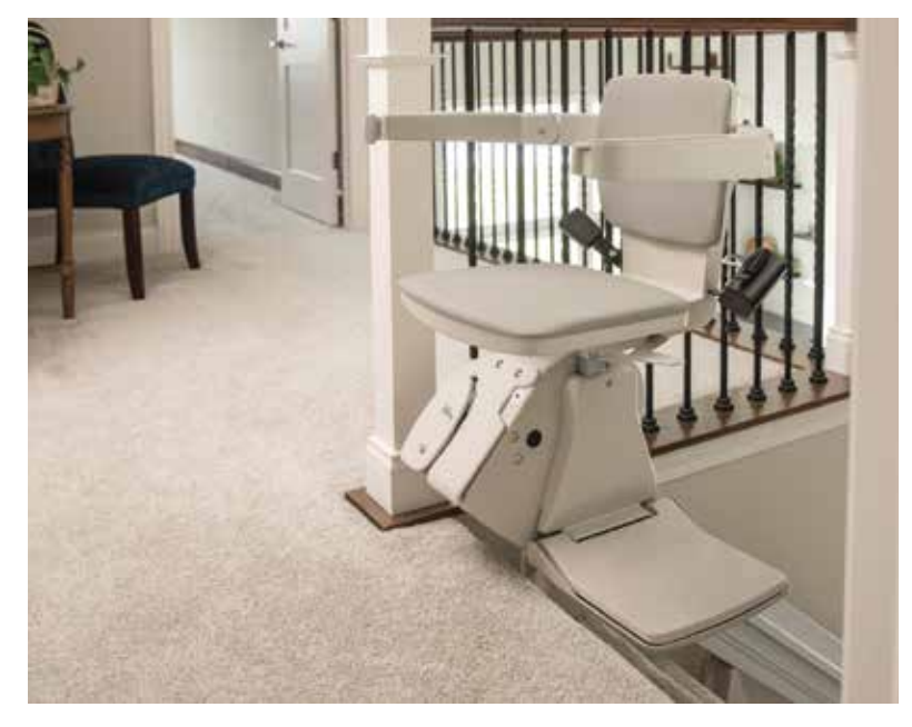
Offset swivel seat makes getting on/off easy.