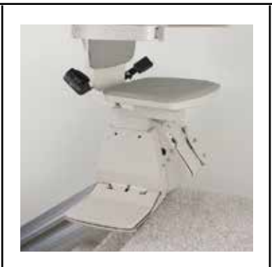
Power swivel seat for effortless exit. Armrest switch control or wireless call/send.