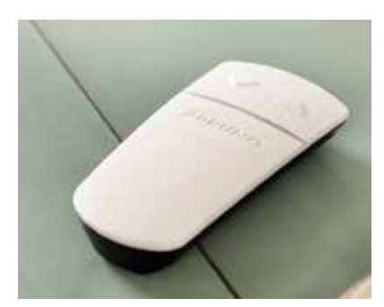
Two wireless call/sends allow remote control access.