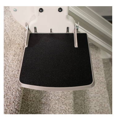
Not all options are shown.