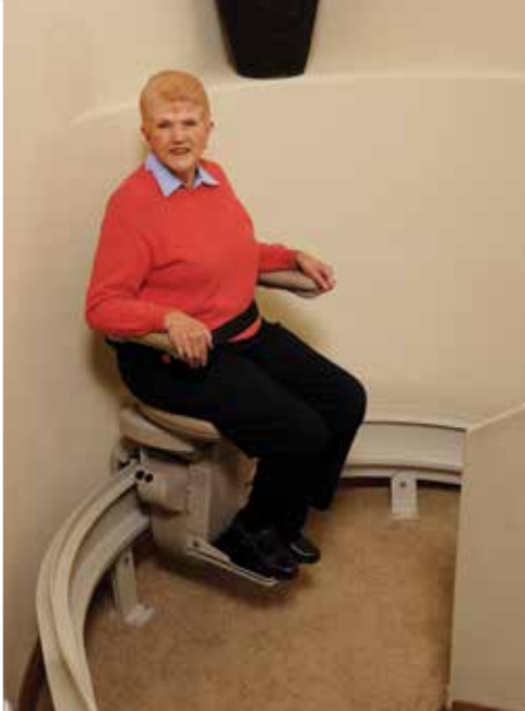
Custom crafted for a precision fit around curves.