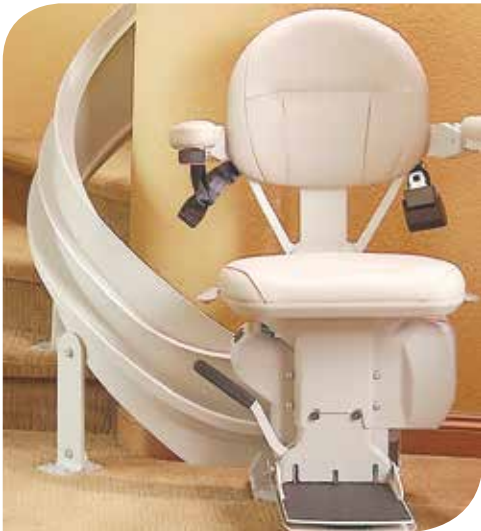
Luxury styling and comfort.

Standard tan vinyl with five optional upholstery selections. Or, supply your own fabric and Bruno will custom upholster the chair for you.