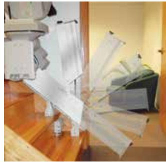
Power or manual folding rails for narrow hallway or when doorway is at the bottom of stairs. Manual operation or push button automatic.