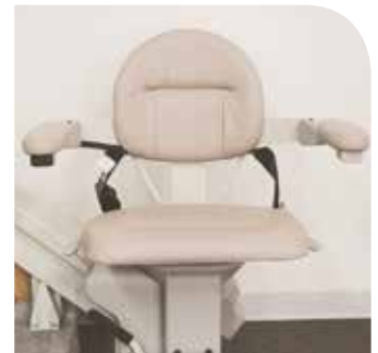
Larger seat and footrest for increased comfort.