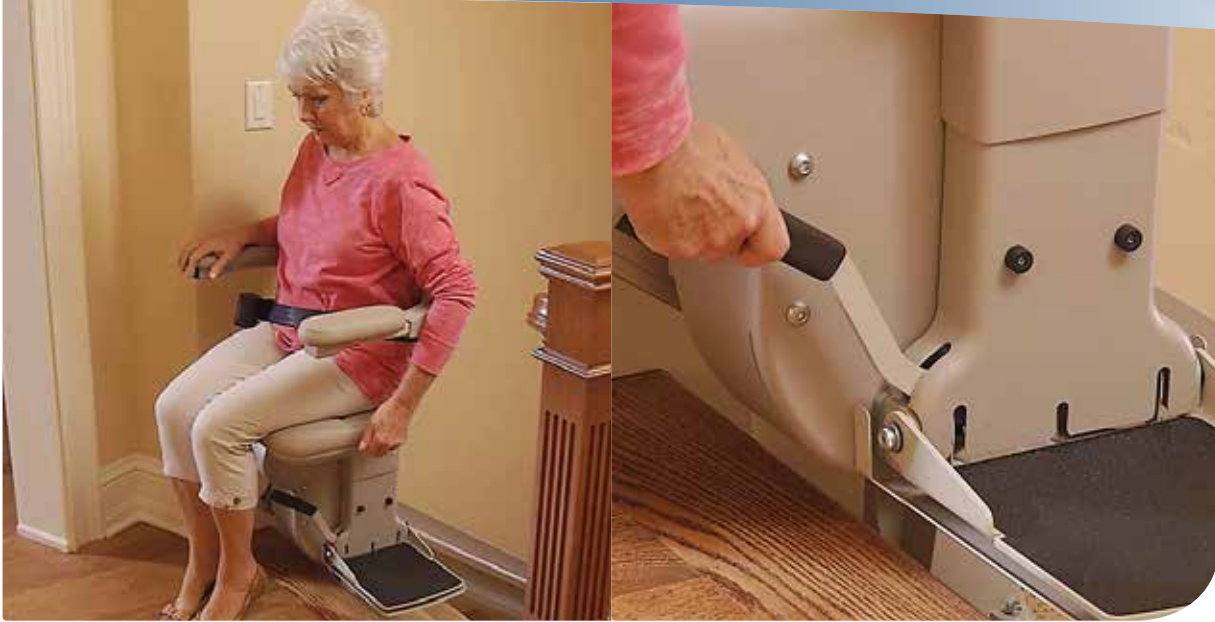
Offset swivel seat makes it easy to get on/off.