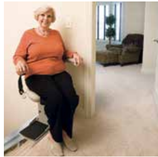
Power swivel seat for effortless exit. Controlled on chair arm or wireless call/send.