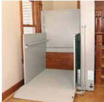
Vertical Platform Lifts