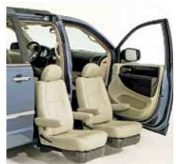
Valet® Signature Seating