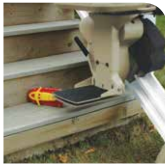
Footrest/carriage safety sensors stop the unit when obstruction encountered.