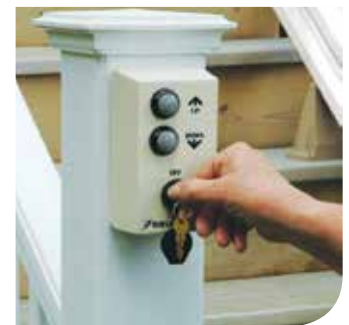
Two wireless call/send controls.