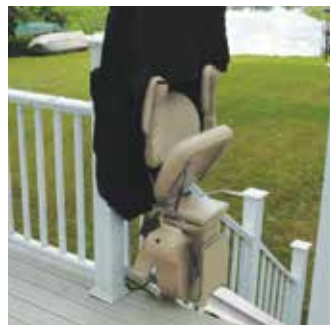
Flip up arms, seat and footrest create plenty of extra space on steps.